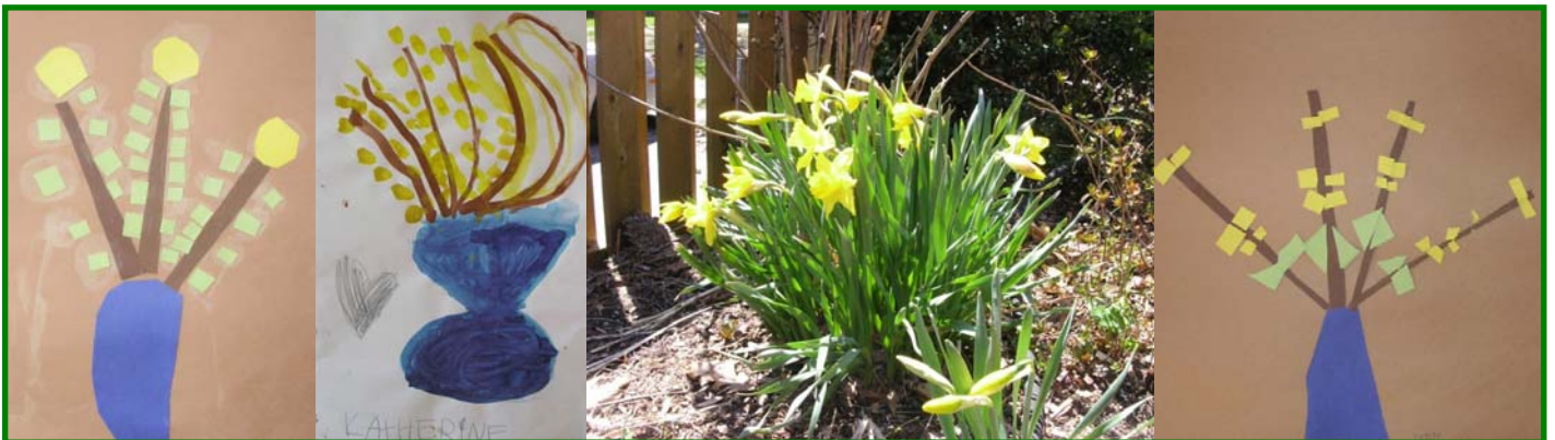
Visions of spring, indoors and out (drawings courtesy of the Kindergarten)

May 19 (Saturday) 8 am - noon Final parent workday: if you haven't gone to one yet, you're heartily invited (and, indeed, expected)!