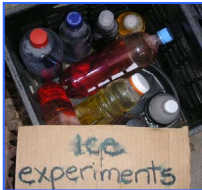
In the Threes classroom, the students study water both solid...